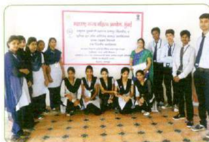
Women Development Cell