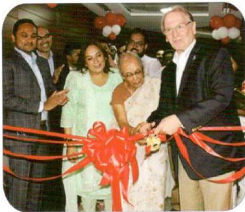
Inauguration of New Wing