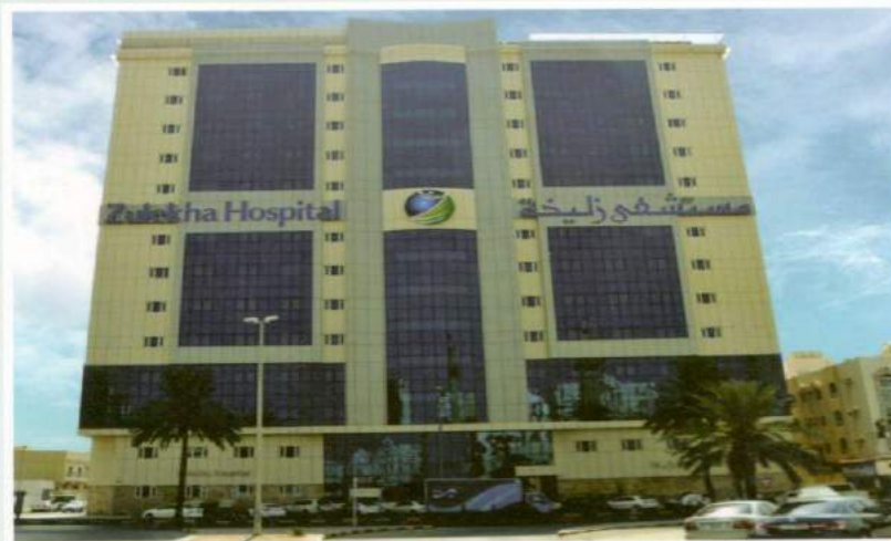
Zulekha Hospital Sharjah (U.A.E.)