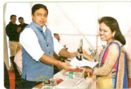
Most Consistent Performer Award