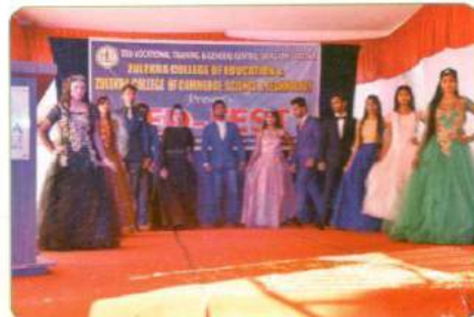
Annual Gathering ZED-FEST 2017-18