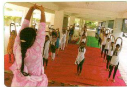
Yoga Day Celebration