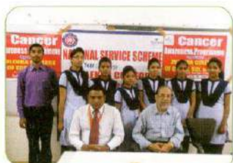
Cancer Awareness Programme