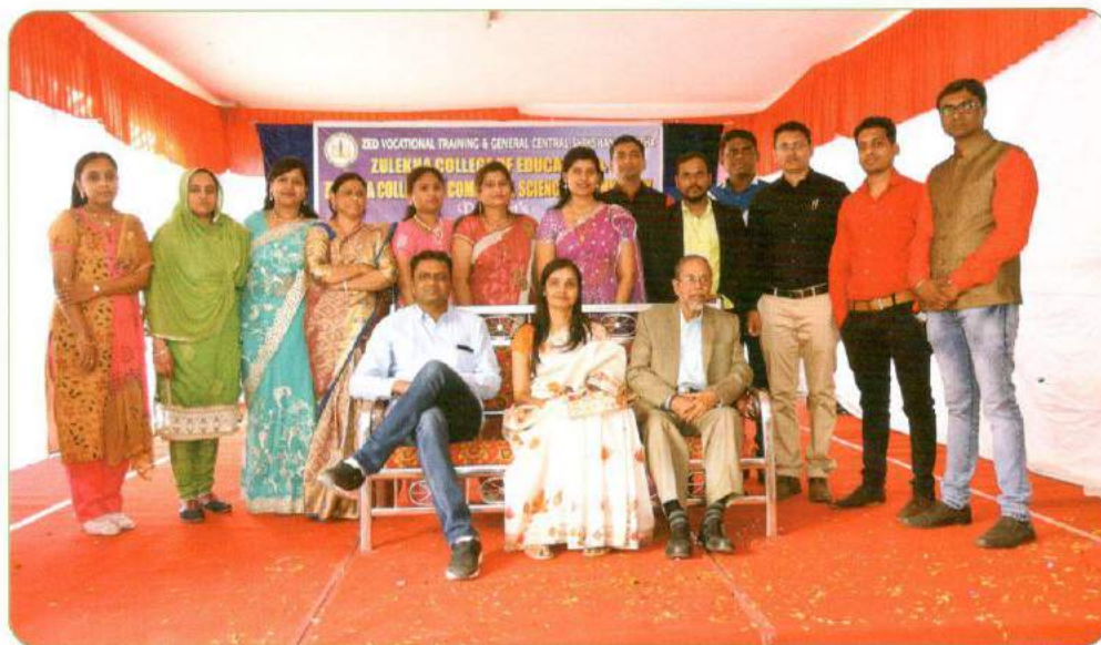
- College Staff -