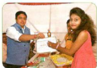
Best Student of the Year

It help develops team spirit and communication skill development, presentation skill development, physical, creative and imagination power development.