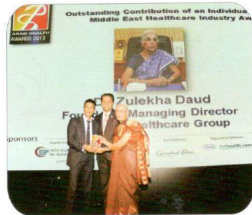
Arab Health Award