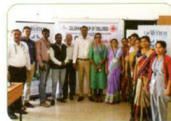
Health Checkup Camp