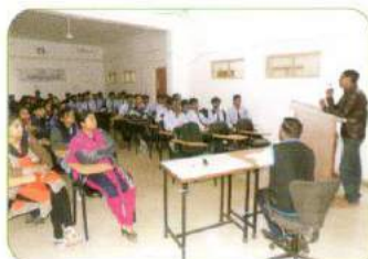
Students Orientation Program