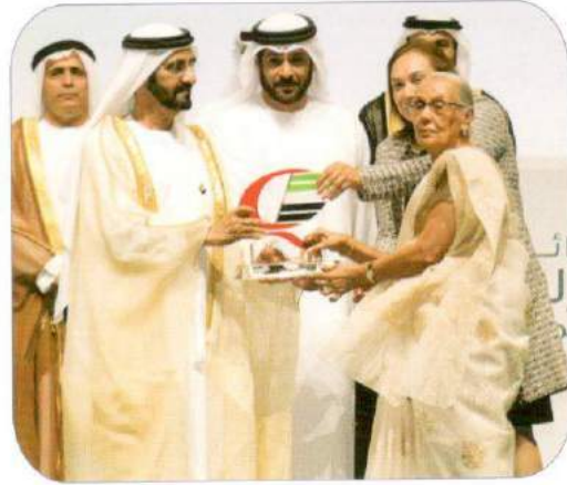
Dubai Chamber CSR Label Award