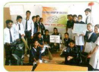
Zulekha College Glimpse