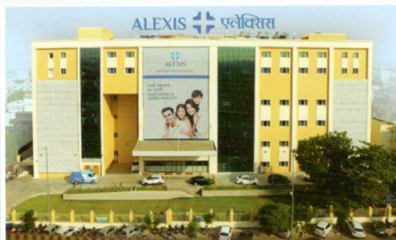
Alexis Hospital Nagpur (India)