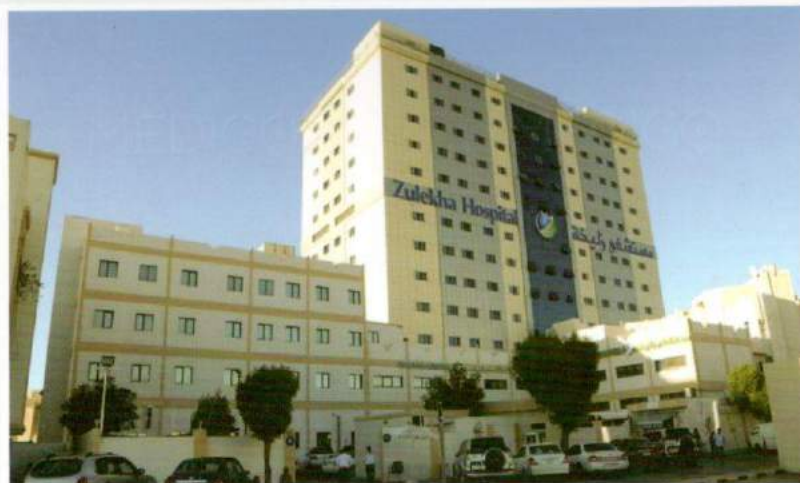
Zulekha Hospital Dubai (U.A.E.)