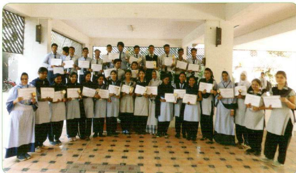
- Excellence at Zulekha -